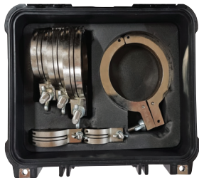
TSGPKIT1-4 Saw guide kit pipe 1-4" (25 - 100 mm)