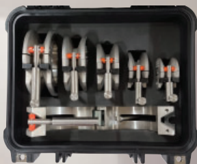
TSTCKIT1-4 Tack clamp tube 1-4" (25 - 100 mm)