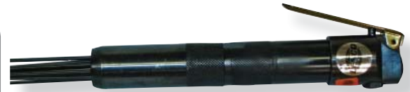
08737 Replacement needles