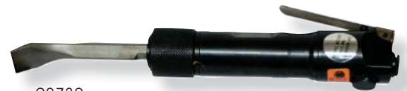
08732 Replacement chisel