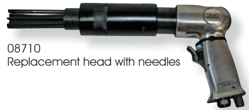
08710 Replacement head with needles