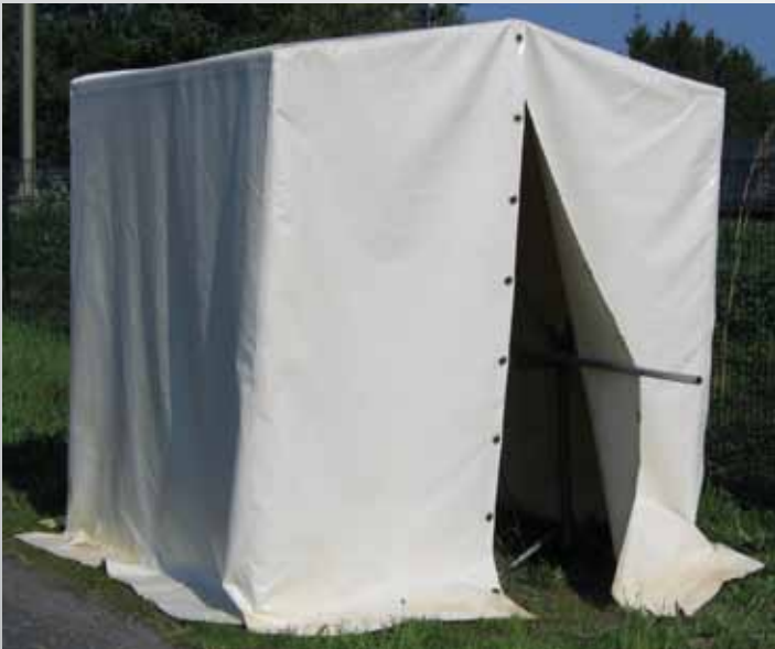
Height 200/220cm x Width 190cm x depth 200cm

The CEPRO welding tent is an environmental tent providing protection from the elements while you work. Great arc flash protection for others while welding. Quick and easy to assemble. The strong 25mm dia galvanized tube frame, is covered with a white reinforced PVC - self extinguishing (french standard m2) fabric.